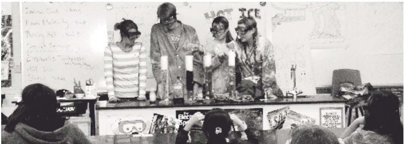
Truckee High students using science equipment funded by Excellence in Education.

To purchase math manipulatives (Tower Fraction Cubes) to aid instruction in fractions, decimals and percents. $250