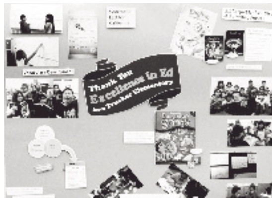
Truckee Elementary grant display.

To purchase musical plays and costumes which enrich the core curriculum. $397