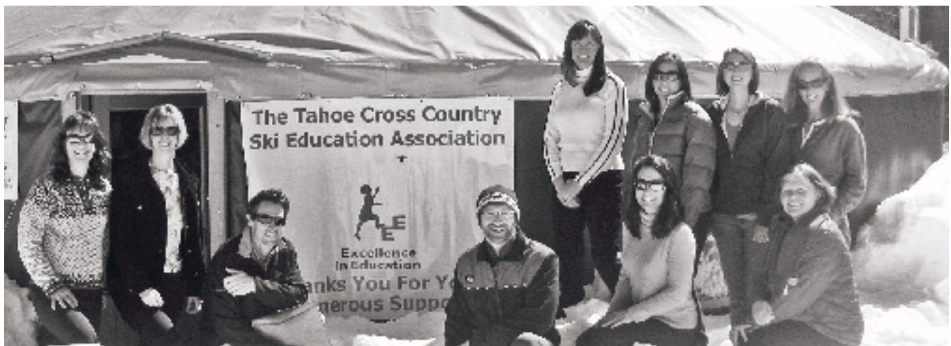
Excellence in Education board members visit the Winter Discovery Program yurt in Tahoe City.

The Foundation is governed by an all-volunteer Board of Directors and Advisory Board of over 40 community members with a broad range of experience, representing all geographic areas of the community.