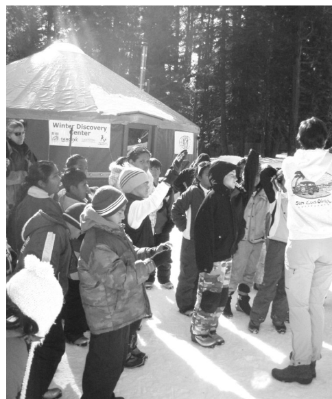
Students gather outside the new yurt being used for the Winter Discovery Program.

Next time you are in Tahoe City, go check out the new yurt being used for the Winter Discovery Program at the Tahoe City XC Center. The program is a collaborative effort between the Tahoe Cross Country Ski Education Association and Sierra Watershed Education Partnerships (SWEP).