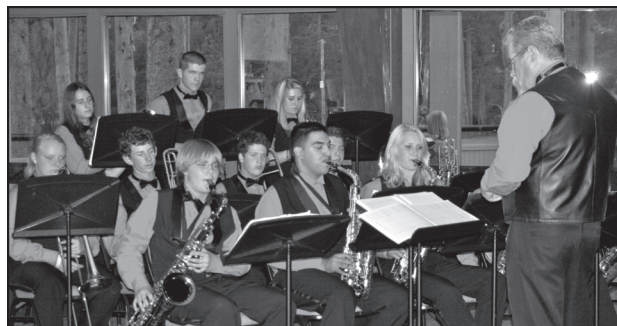
Truckee High Jazz Band performing at the Excellence in Education Recognition Event. Excellence in Education recently funded the Truckee High School Band $3,750 for instruments, sheet music, and speakers.

entry points for students to connect to a supportive adult and access community wellness services. A key component of this project is that students will be actively involved in the planning and shaping of the Wellness Centers at their school sites. Wellness Centers are slated to open on campuses in January.