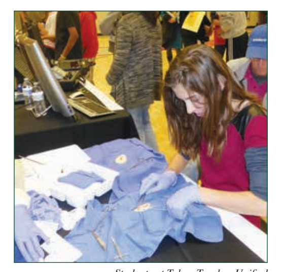
Students at Tahoe Truckee Unified School District STEAM Fair.

Excellence in Education has made a three-year commitment to provide funding to Aim High. Aim High is the largest academic summer program provider in the Bay Area and added Tahoe/Truckee area in the summer of