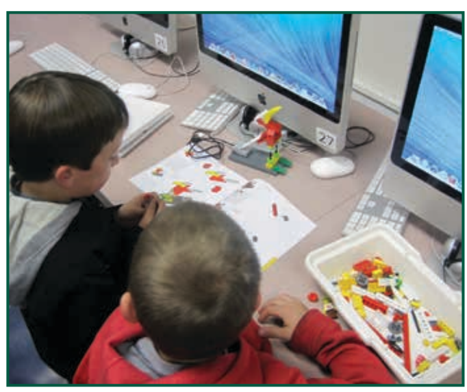
Lego robotic construction at Truckee Elementary School