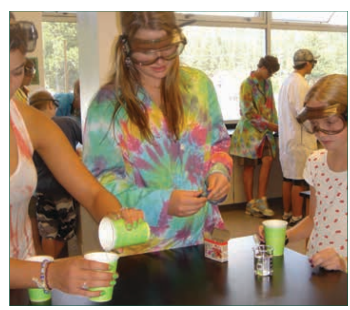
Science class at a Tahoe Truckee Unified District School