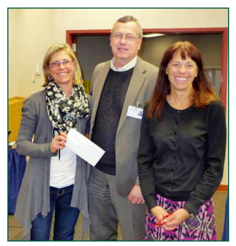
Excellence in Education presenting the fall grant cycle check to Truckee Tahoe Unified School District.