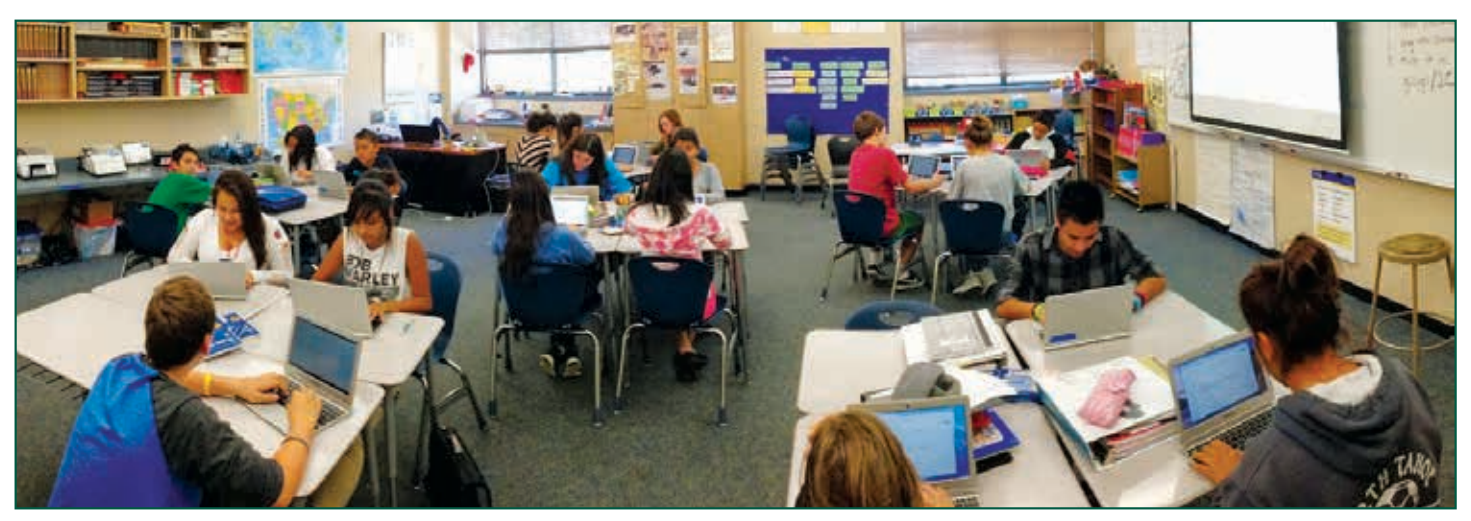
Chromebooks in the classroom