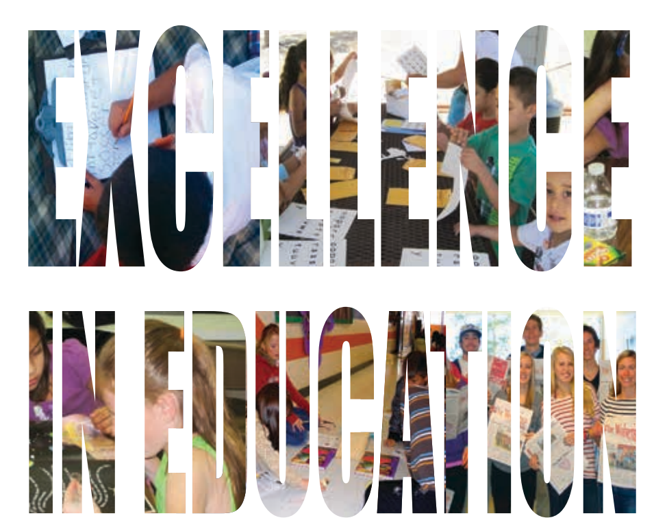
Foundation Annual Report 2013/14