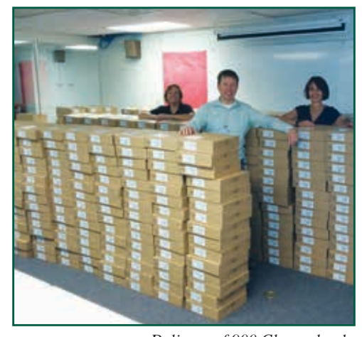
Delivery of 900 Chromebooks to Tahoe Truckee Unified School District.